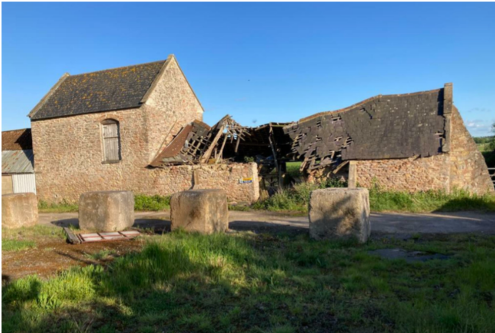
Southway Farm Buildings, Polsham, Wells, Somerset, BA5 1RW